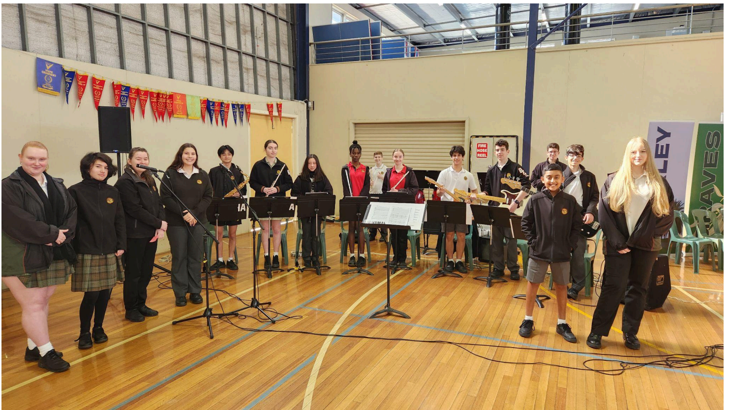
Production Band Performance at General Assembly, 2024.