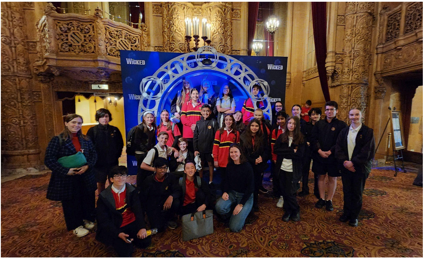
Excursion to see Wicked! – The Musical, 2024.